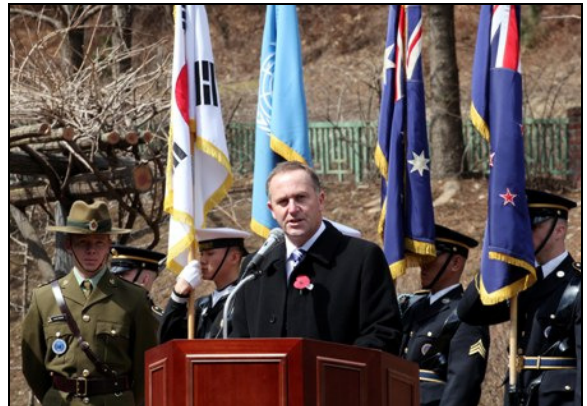
Prime Minister Key delivering the address at a wreath laying ceremony at the ANZAC Memorial in Kapyeong.