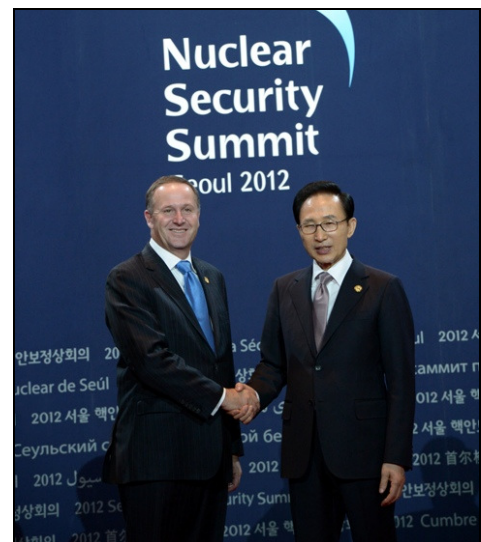
Prime Minister Key being greeted by President Lee Myung-bak at the Second Nuclear Security Summit in Seoul.