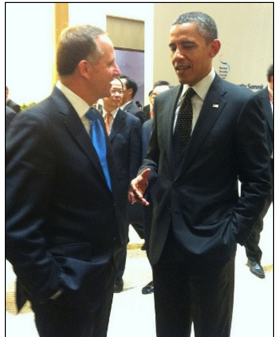
Prime Minister Key talking with President Obama.

leaders, Mr Key described the Summit as an important step towards securing nuclear materials and reducing the global threat of nuclear terrorism. The Prime Minister announced that New Zealand would contribute NZ$500,000 towards a project to remove highly-enriched uranium from Uzbekistan back to Russia to be reprocessed and securely stored. "This project reinforces our support for the securing of vulnerable nuclear materials worldwide," Prime Minister Key said.