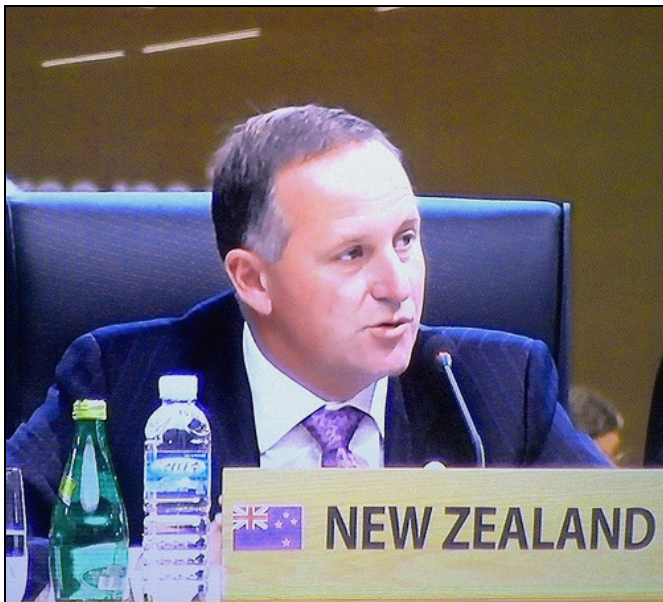
Prime Minister Key delivering a statement at the Second Nuclear Security Summit held in Seoul on 26-27 March.

Prime Minister Key joined 52 leaders for the Second Nuclear Security Summit, held on 26-27 March at the COEX International Convention Centre in Seoul. During his address to the gathered