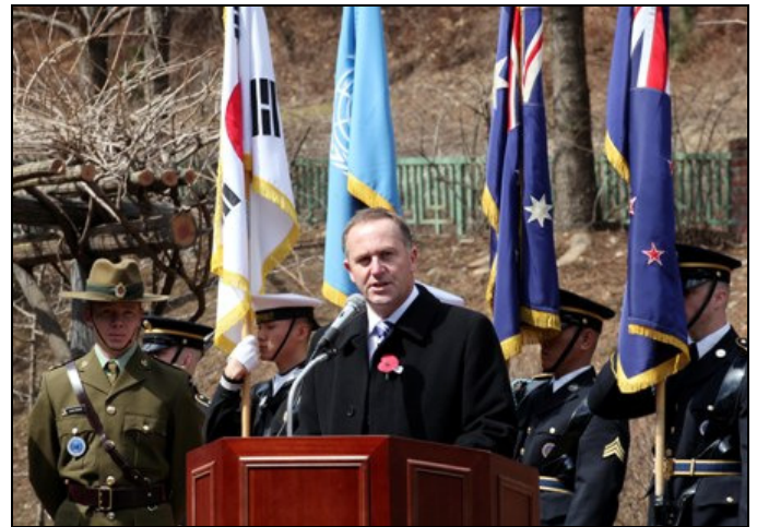
Prime Minister Key delivering the address at a wreath laying ceremony at the ANZAC Memorial in Kapyeong.

Prime Minister Key conducted a wreath laying ceremony at the ANZAC Memorial at Kapyeong on 25 March, attended by a wide range of dignitaries including the Korean Minister of Patriots and Veterans Affairs Hon Park Song-Choon, senior United Nations Command and Korean military and a representative from the Australian Embassy. The moving ceremony held on a crisp and clear morning honoured the New Zealand and Australian service members who served during the Korean War. Prime Minister Key spoke of New Zealand's contribution to the allied effort during the war and our ongoing contribution to peace on the Korean peninsula.