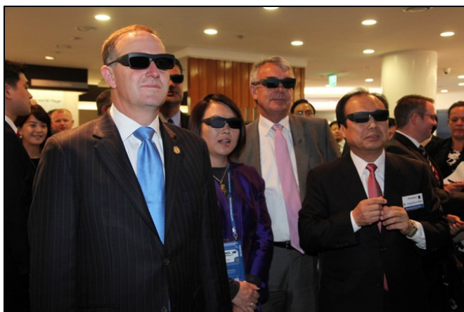
Prime Minister Key and Melissa Lee MP watching 3D TV.

The Prime Minister visited Samsung Electronics' Research and Development campus in Suwon on 26 March. The visit gave support to New Zealand's