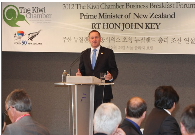
Prime Minister Key stressed the benefits of a Korea-New Zealand FTA at the Kiwi Chamber business breakfast on 26 March.

the risk of trade diversion, and enhance Korea's food security.