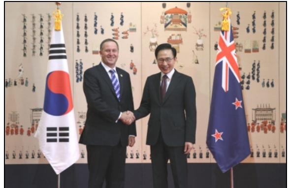
Prime Minister Key meeting with President Lee Myung-bak at the Blue House.

Website: www.nzembassy.com/korea ; E-mail: nzembasel@kornet.net