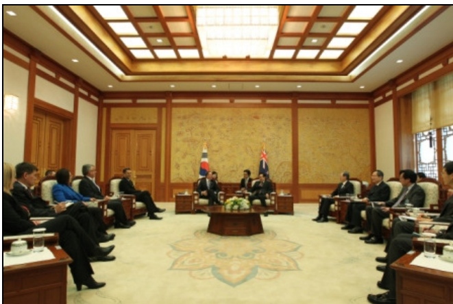
Prime Minister Key meeting with President Lee at the Blue House.

The Prime Minister met with President Lee Myung-bak on 25 March at the presidential Blue House. Their conversation emphasised the strong, warm and friendly relationship existing between New Zealand and Korea and also highlighted the two leaders' shared ambition to conclude a free trade agreement. President Lee described the deep affection many Koreans have for New Zealand. Both leaders highlighted the significance of the Year of Friendship.