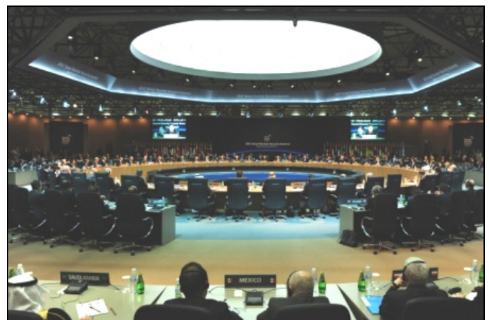
The Second Nuclear Security Summit held in Seoul was attended by 53 leaders.

The states represented at the Summit issued a communiqué that will guide their collective work until the third Nuclear Security Summit in the Netherlands in 2014.