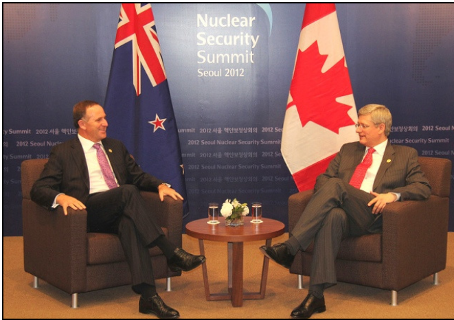
Prime Minister Key meeting with Canadian Prime Minister Harper.

During the Nuclear Security Summit, Prime Minister Key took the opportunity to hold bilateral meetings with several leaders including Vietnam Prime Minister Nguyen Tan Dung, Thailand Prime Minister Ms Yingluck Shinawatra, Chilean President Sebastian Pinera, and Canadian Prime Minister Stephen Harper.